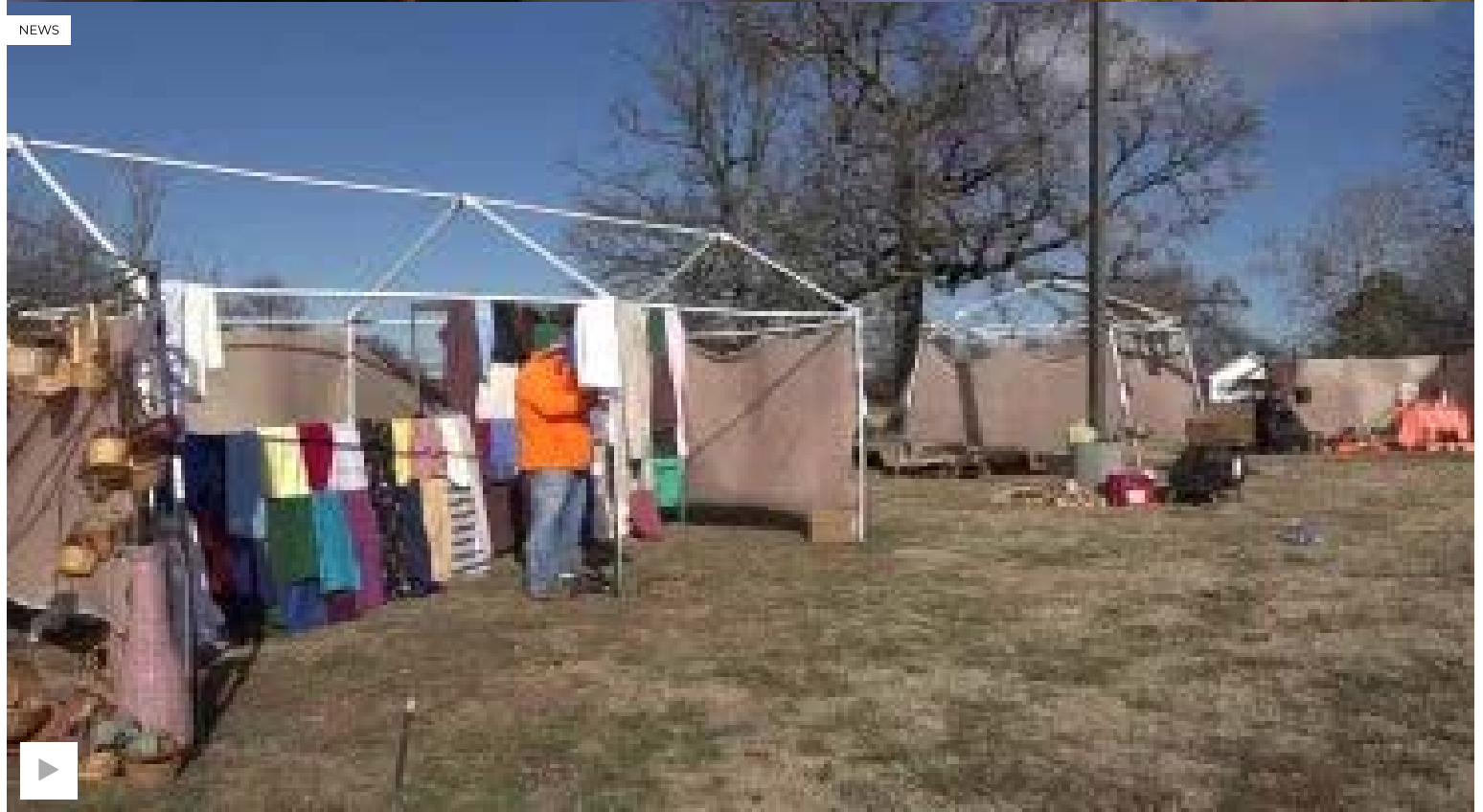
Local Church Brings Nativity To Northwest Arkansas